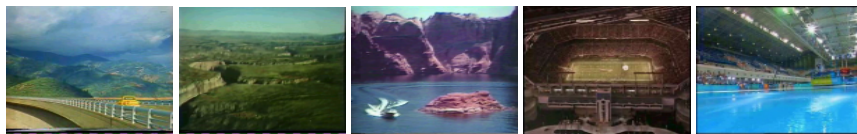
(a) from BOR08 (b) from BOR11 (c) from BOR19 (d) from Movie3 (e) from Sports2