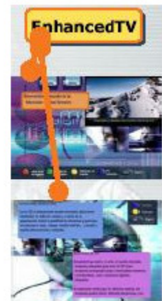
On this pool of basic applications the different applications can be combined.