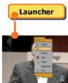
To enable access to and navigation in applications a launcher tool is developed: